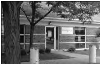
Lake Elmo Pharmacy, a full service retail and compounding pharmacy is located conveniently on Stillwater Boulevard .

Lake Elmo Pharmacy is also unique in that it is a compounding pharmacy, one of only a handful located in the twin cities. If you're not familiar with compounding, it is a process that enables pharmacists to prepare customized medications to meet each patient's specific needs. Some examples of the specialized medications that can be prepared through compounding include: unique dosage forms containing the best dose of medication for each individual; medications free of problem-causing excipients such as sugar, lactose, dyes, alcohol, gluten or preservatives; combinations of various compatible medications into a single dosage form for easier administration and improved compliance; medications that are not commercially available and novel medication delivery systems. Lake Elmo Pharmacy also specializes in women's health and veterinary medications.