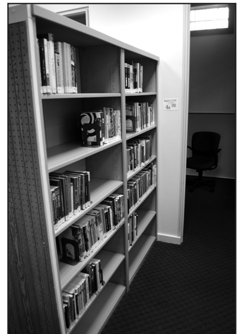
The Lake Elmo Library offers many resources including the growing selection of young adult fiction, pictured above.

Book contributions are welcomed and can be dropped off at the library or City Hall during business hours.