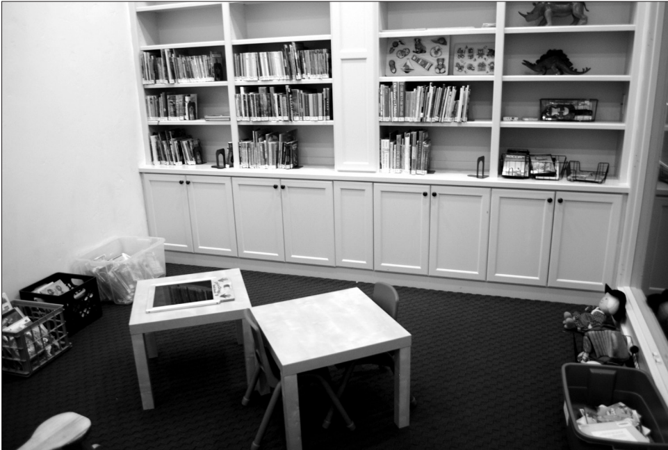
A view of the children's room in the new Lake Elmo Public Library, located at 3537 Lake Elmo Blvd. Children's story time is held on the first and third Friday of each month.

The new Lake Elmo Public Library opened officially on September 7, 2012. Along with a large selection of books, a computer lab and reading room, free Wi-fi is also available as well as a complimentary coffee service during open hours, donated by the Friends of the Lake Elmo Public Library.