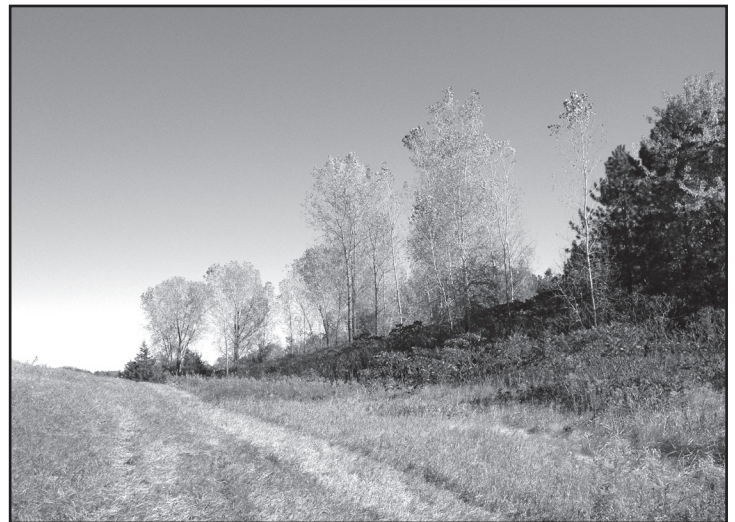
The Lake Elmo Park Commission will be conducting a survey in order to determine how best to allocate funds dedicated to park improvements. Sunfish Lake Park, pictured above, is one of the City’s 17 parks.