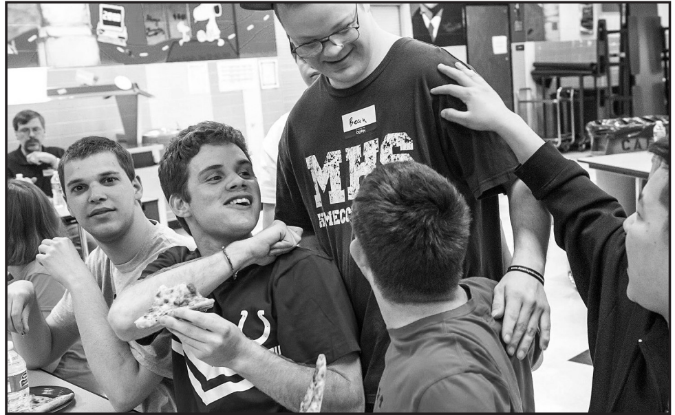
Making friends, having fun at the annual Valley Friendship Club Dance held at Oak-land Jr. High in Lake Elmo.