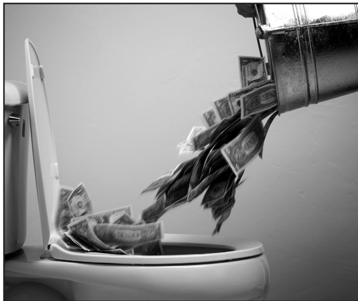
Fixing a leaky toilet not only saves money, but ultimately protects our water supply.

For more information visit the Minnesota Rural Water Association at www.mrwa.com .