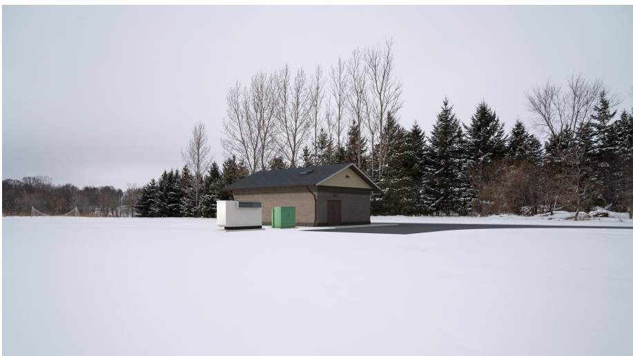
Rendering of Well No. 5 pump house in Tana Ridge Park

An additional part of the 3M Settlement Grand Funds is the construction of a trunk watermain to be installed along 50 th Street North between Lake Elmo Avenue and Lily Avenue North. This work will be completed during the Summer of 2020 to make a critical connection to the City's distribution system to deliver drinking water to City consumers. The watermain will be installed underneath the eastbound driving lane of 50 th Street. In order to complete the work, 50 th Street will be closed to eastbound traffic for the duration of the project (6-8 weeks). Advance warning sign and traffic detours will be installed in preparation of the start of the work. Local traffic will have access to their driveways during the project.