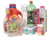
Plastic Bottles & Containers (#1, 2, 5)