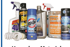
Hazardous Materials (sharps, motor oil, propane, etc.)