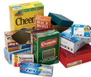
Food & Beverage Boxes