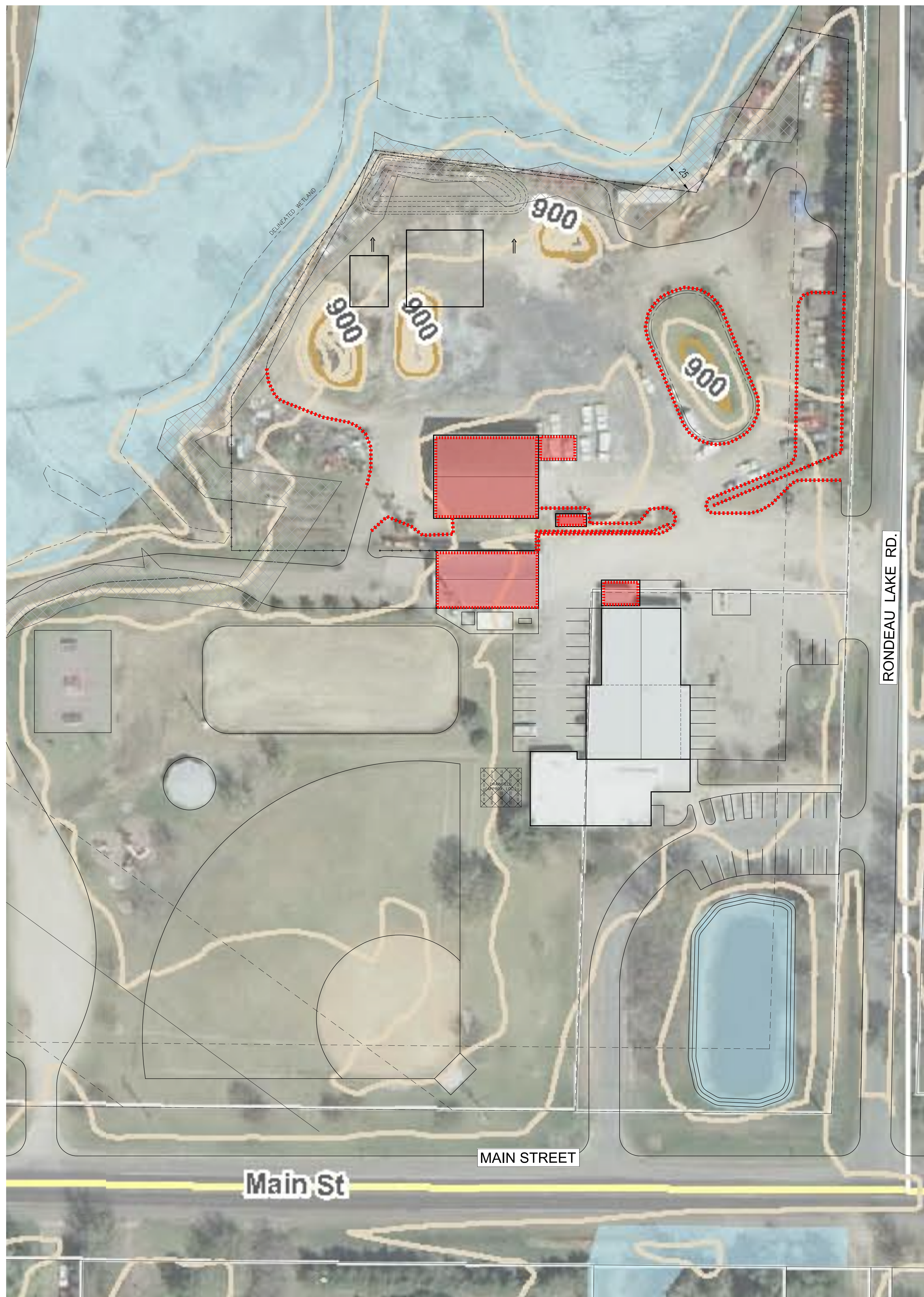
REMOVALS 1" = 40'-0"