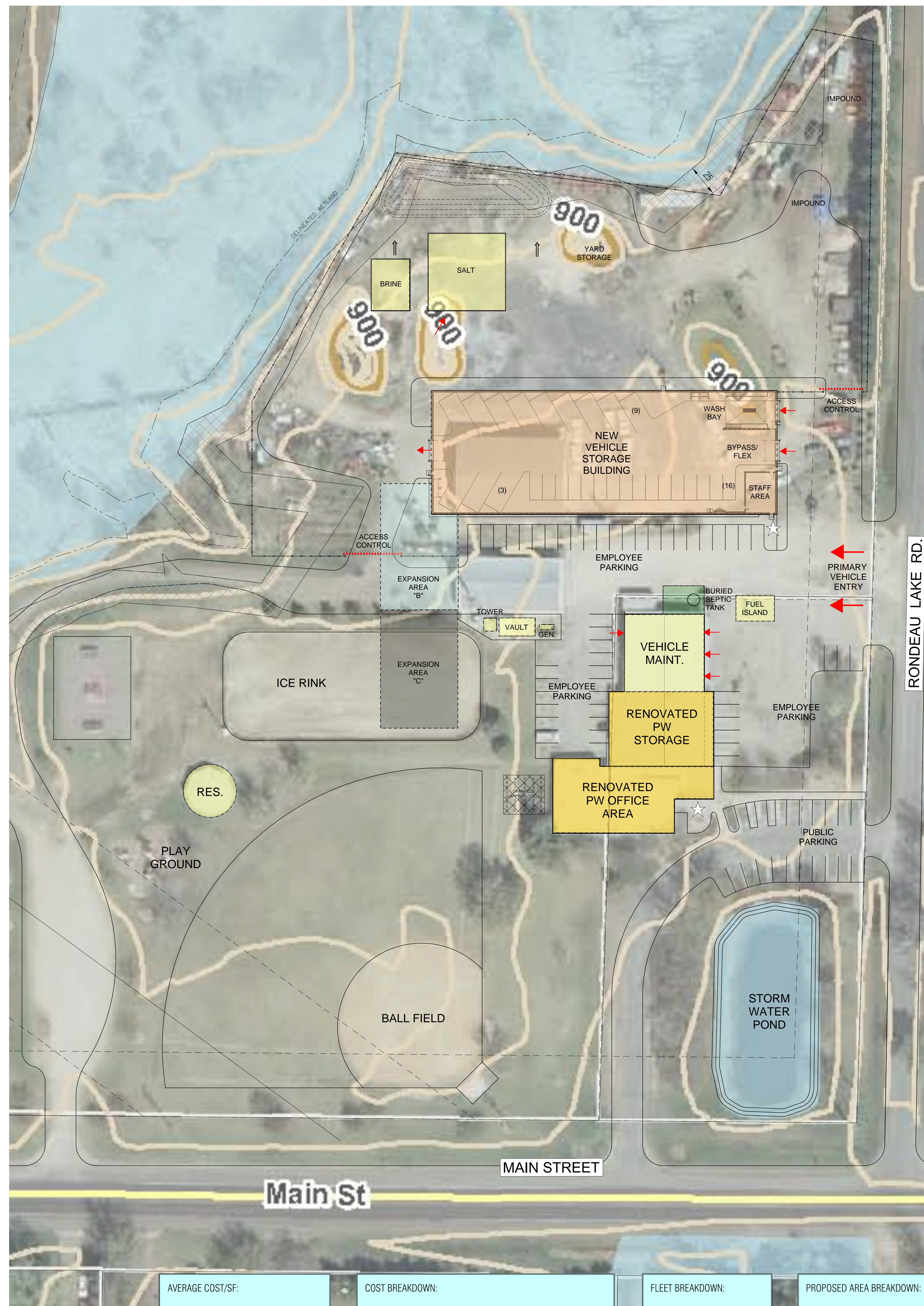
PROPOSED 1" = 40'-0"